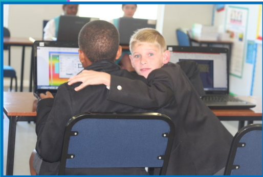
"Partners in crime"